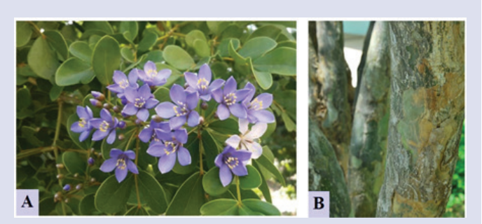
Guaiacum officinale L. A: flower, leave and twig; B: bark

extracts have higher IC_{50} value. This indicates that Guaiacum officinale L. extracts have lower anti-oxidant capacity than those of vitamin C.