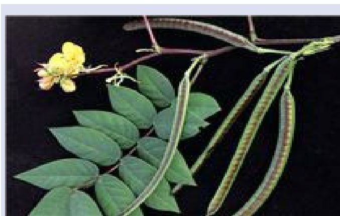
Figure 3: Twig of S. occidentalis .

DPPH radical to yellow colored unstable compound. However, ascorbic acid displays significant scavenging activity over the Cassia occidentalis L. methanolic extract. This might be due to the presence of methoxy group which increases the accessibility of radical center of DPPH to ascorbic acid. 11