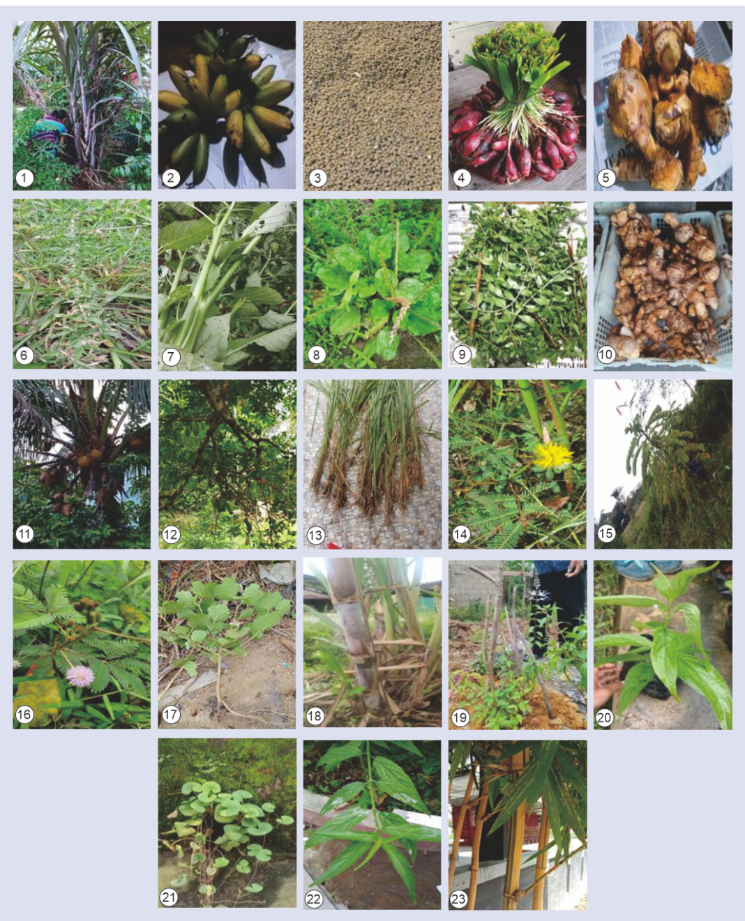
Figure 2: Various types of plants that can overcome jaundice used by ethnic Chinese, Dayaks, and Malays in West Kalimantan: 1. Tebu hitam ( Saccharum officinarum L.), 2. Pisang mas ( Musa paradisiaca L.), 3. Kacang hijau ( Vigna radiata L.), 4. Bawang dayak ( Eleutherine palmifolia (L.) Merr.), 5. Temulawak ( Curcuma xanthorrhiza Roxb.), 6. Lipan-lipan ( Chrysopogon aciculatus (Retz.) Trin), 7. Ciplukan ( Physalis angulata L.), 8. Cha chen chou/ sawi ( Plantago mayor L.), 9. Inai ( Lawsonia inermis L), 10. Kunyit ( Curcuma domestica Val.), 11. Kelapa gading ( Cocos oburen Durch), 12. Belimbing manis ( Averrhoa Carambola L.), 13. Ilalang (Imperata cylindrica (L) Beauv.), 14. Sia li chi o kin/putri malu kuning ( Neptunia oleracea Lour.), 15. Ketepeng ( Senna alata (L.) Roxb.), 16. Putri malu bunga ungu ( Mimosa pudica L.), 17. Stet ma thio kin/bunga kancing ( Urena lobata L.), 18. Tebu karak ( Saccharum officinarum L.), 19. Kumis kucing ( Orthosiphon aristatus (Blume) Miq.), 20. Empedu tanah/sambiloto ( Andrographis paniculata (Burm.f.) Wall. ex Nees), 21. Pegage/pegagan ( Centella asiatica L. Urban), 22. Kai kut chou/tulang ayam ( Clinacanthus nutans (Burm.f.) Lindau), and 23. Bambu kuning ( Bambusa vulgaris Schrad.).