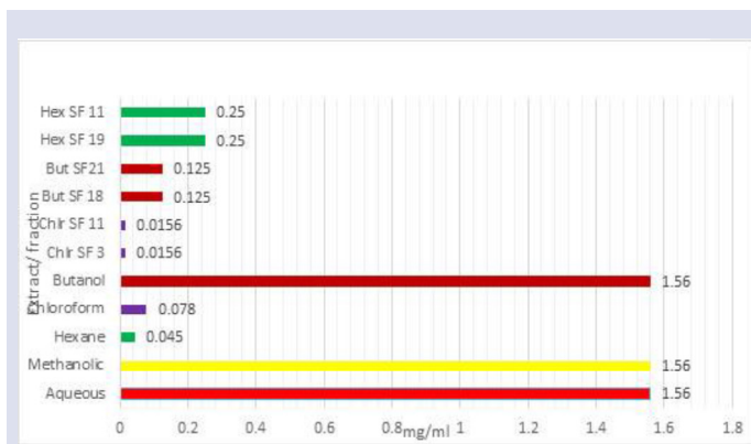
Figure 1: Minimum Inhibitory Concentration of various extracts and sub fractions of Curry leaf on hatch of Haemonchus contortus eggs.