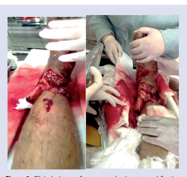
Figure 2. Clinical picture after open reduction external fixation was performed (2 weeks after 1^{\rm st} surgery).