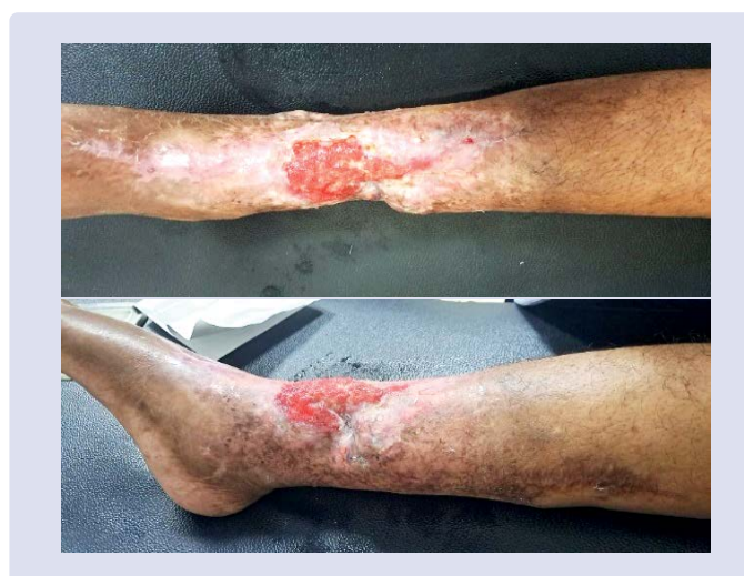
Figure 6. Three months after interpolated pedicle flap surgery.