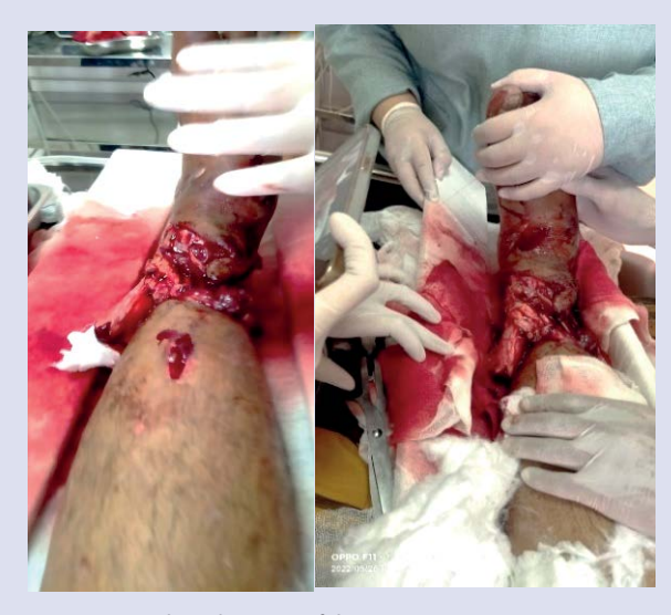
Figure 1. Clinical picture of the injury at emergency room.