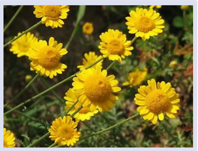
Figure 2. A photograph of Anthemis tinctorial.

Figure 1. A photograph of Anthemis chia. L.