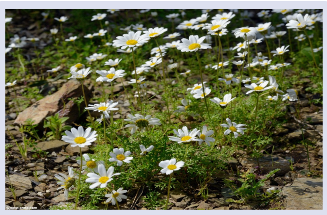
Figure 1. A photograph of Anthemis chia. L.