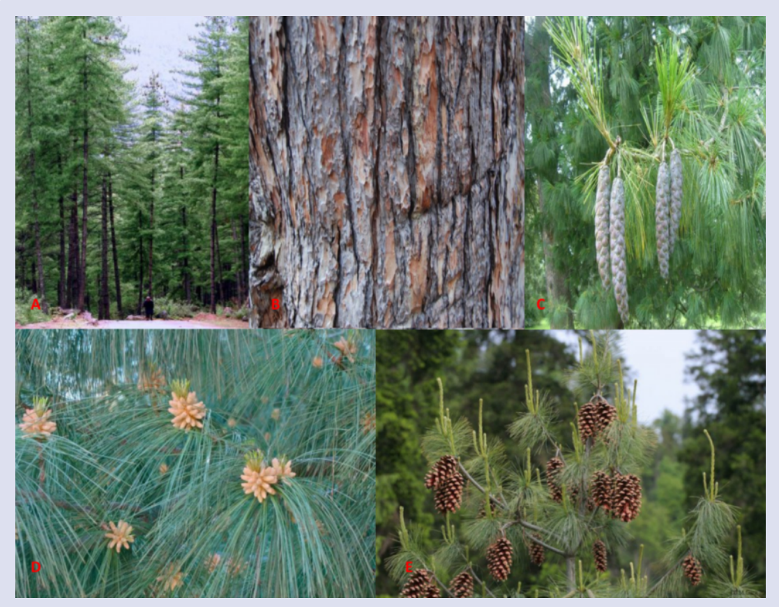
Figure 1: Pinus wallichiana A.B. Jacks: (A) Full grown trees in natural habitat, (B) Barks, (C) Unripe female cones, (D) Male Cones with vegetative leaves, (E) Ripe female cones with vegetative leaves.<sup>12</sup>