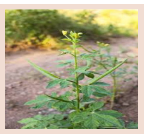
Figure 1: Cleome viscosa Linn Plant<sup>3</sup>

Order: Capparales Family: Capparaceae Genus: Cleome Linn. Species: Cleome viscosa Linn