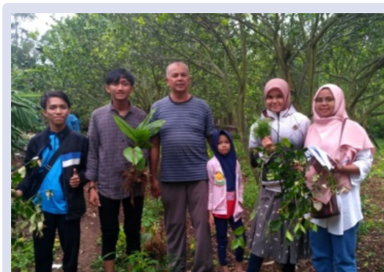
Figure 1: The research team and resource.