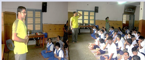
Nadishodhana & Kapalabhati Pranayama: Being instructed