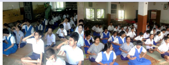
Nadishodhana & Kapalabhati Pranayama: Being Performed

Results of present study demonstrate that regular practice of integrated yoga has beneficial influence on memory and cardio-respiratory functions in the children with special needs.