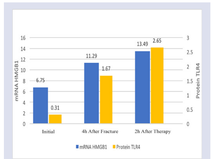
Figure 1: An expression of HMGB1 mRNA and TLR4 protein levels in both control groups

The initial expression of the mean HMGB1 mRNA \pm SD was 6.73 \pm 0.66, after 4 h of sterile injury increased to 11.90 \pm 0.62 and 2 h after lidocaine therapy decreased to 6.94 \pm 0.51. The mRNA HMGB1 expression decreases significantly, p value < 0.00. Preliminary TLR4 protein content of mean \pm SD is 0.30 \pm 0.13, after 4 h of sterile injury increased to 1.83 \pm 0.24 and 2 h after