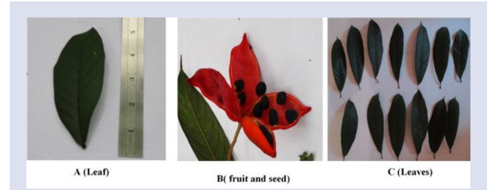
Figure 1: The Macroscopic leaves, fruits and seed of SR.